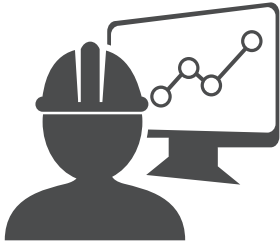
Operations & Process Engineers