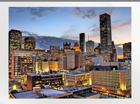
Visit learning.cccglobal.com to find regional training near you!