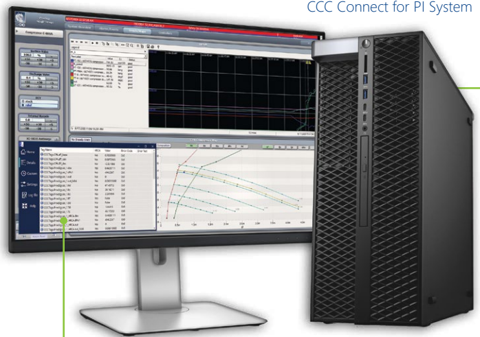
TrainTools Server with CCC Connect for PI System

Leveraging the ecosystem of OSIsoft® PI System, customers can access high-fidelity data wherever-whenever, using the tools they're familiar with.